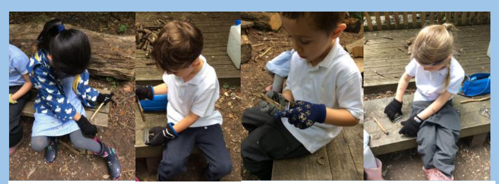
In our last nature reserve visit, we learnt to whittle sticks using potato peelers.