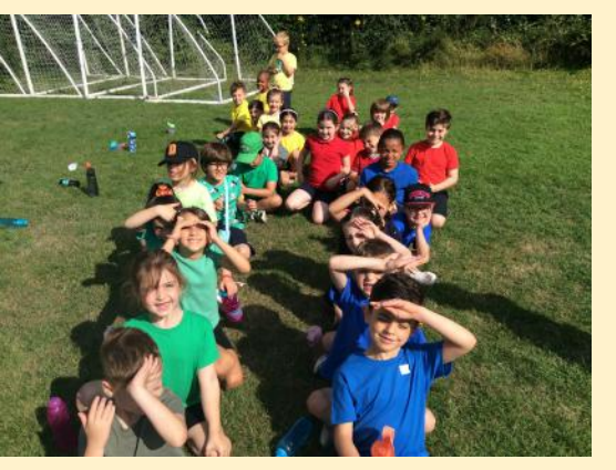
Teddy bears picnic!