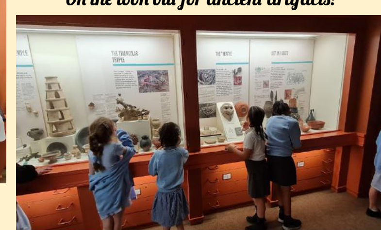
On the look out for ancient artifacts!