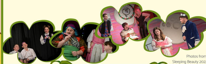
Photos from Sleeping Beauty 2022

It's the classic story you know, with a bucket-load of stjamesmad magic thrown in!