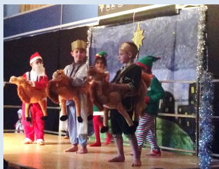
KS1: Three wise men and one wise Santa!

St James Trust, visited us this half term for a tour of the school and to see us in action. It made me very proud to show him round the school and see the children enjoying their lessons, working hard and engaging in challenges. Year 4 for instance were doing an investigation into time that involved calculating some tricky multiplication sums, but they weren't thrown at all!