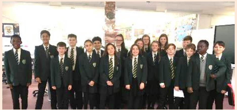
Year 7 students from Little Reddings Primary School (Blackman class)