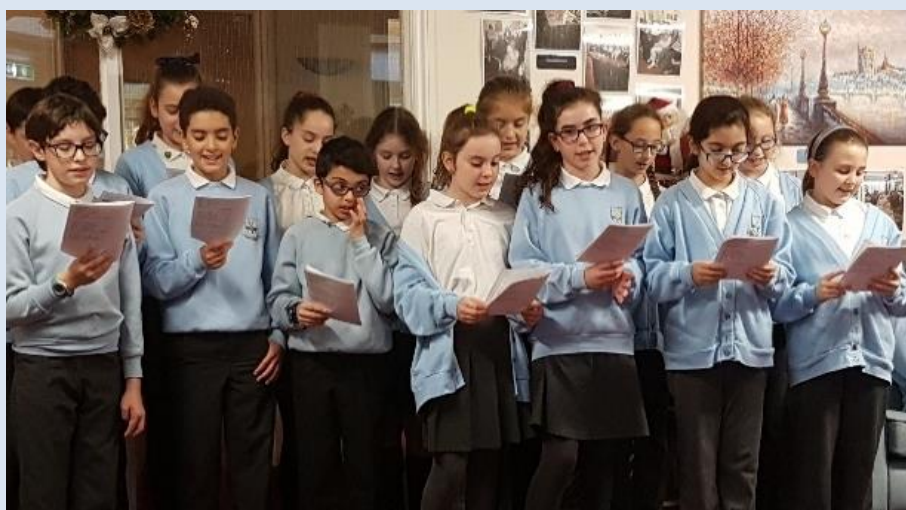
Y6 visit Heath House (thanks to the mini-bus)