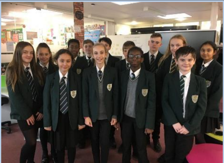
Year 7 students from Little Reddings Primary School (Rowling class)