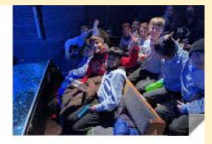
Enjoying the play Maybe there's a Castle