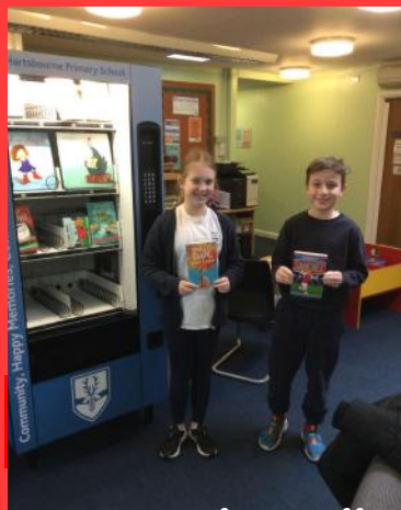
Receiving their well deserve books