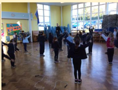
Feeling Good Week