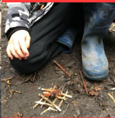
Demonstrating why this class are bright sparks - who when they get going can be on fire!