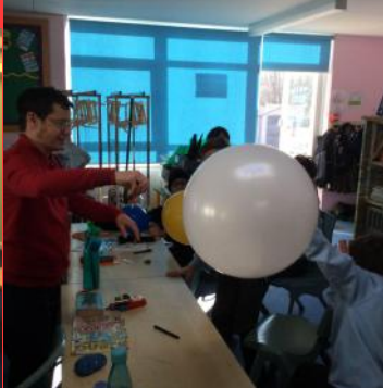
Bursting Balloons on wellbeing week