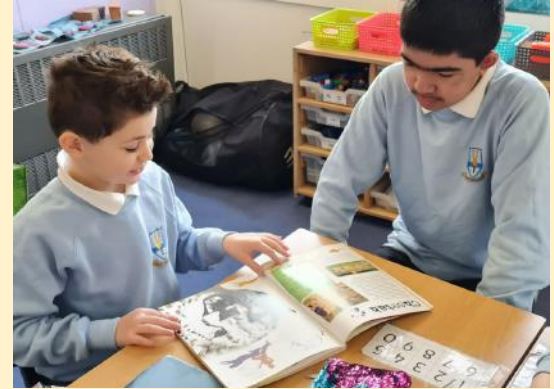
Skipping, rock painting and shared reading with Year 6 for Feeling Good Week!