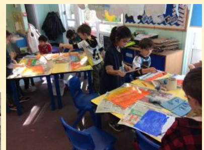
Adventure stories with teddies