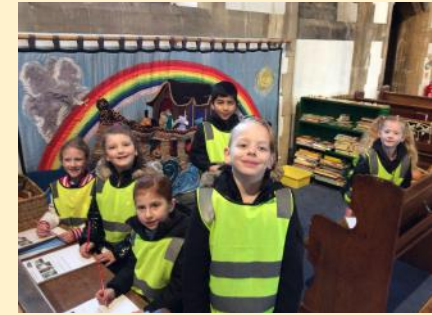
Visit to St Peter's