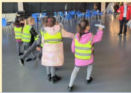
We had a brilliant workshop about the history of flight and then had a glider throwing competition.