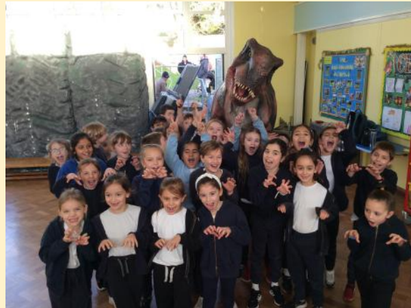
Prehistoric Adventures during Dinosaur Week!