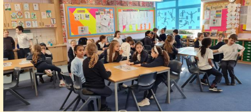
Quizzing each other on French landmarks!