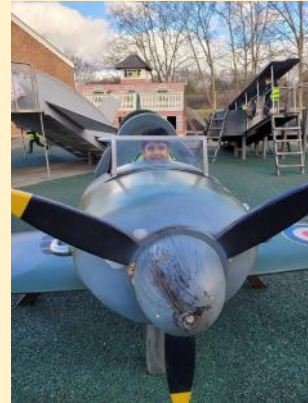
We loved playing in the plane themed playground.