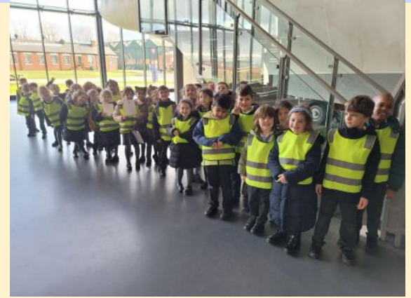
Our trip to the RAF museum!