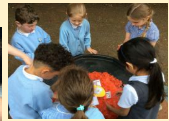
The Life Cycle of a chick