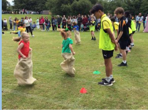
We had a great time at Sports Day and enjoyed taking part in lots of different activities..