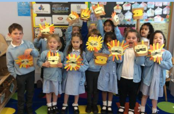
We went to the Radett Centre to see The Lion and the Mouse with Year 1. Some children chose to make lion puppets.