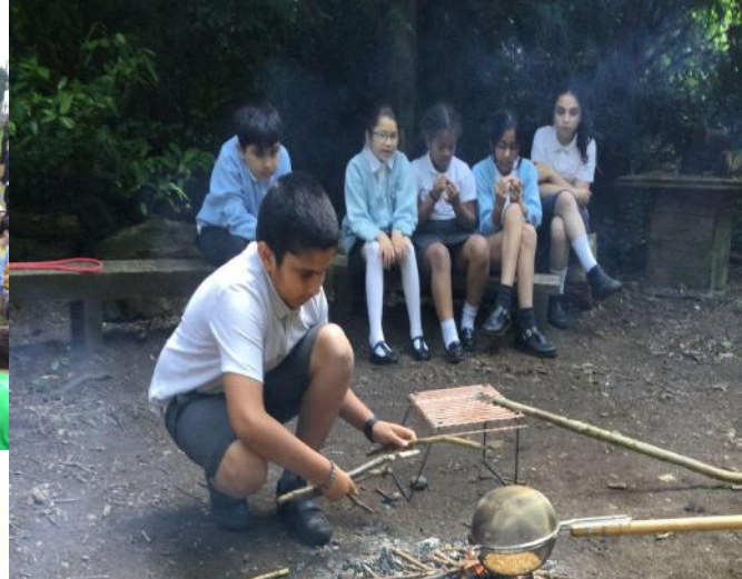
Making Popcorn in Forest School