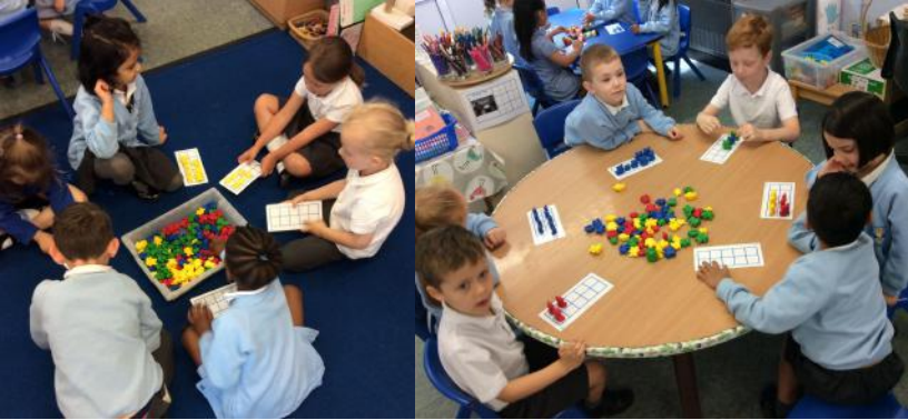
In maths, we learnt about odd and even numbers. We made different odd and even numbers in tens frames.