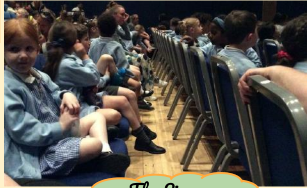
The Lion Inside