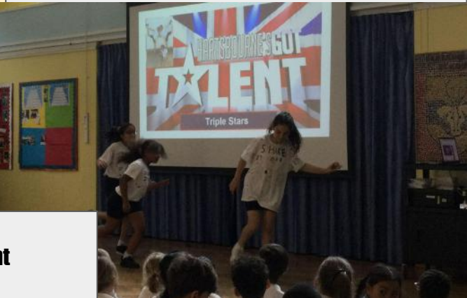
Hartsbourne's Got Talent