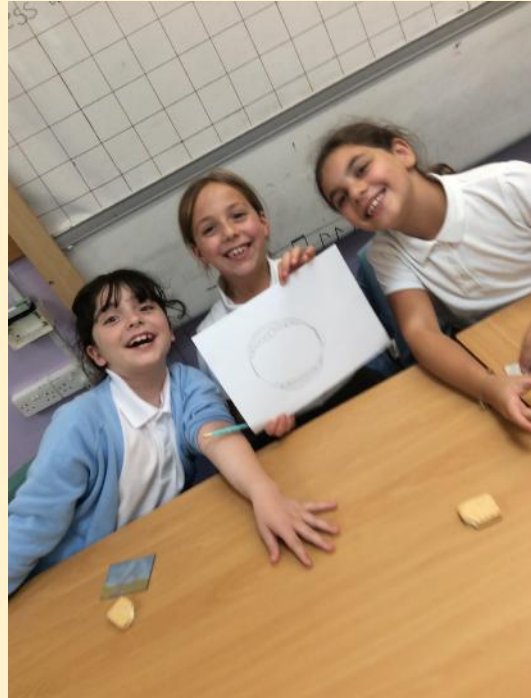
Investigating our teeth in Science.