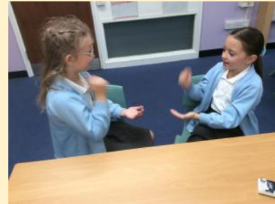
Ancient Egyptian games