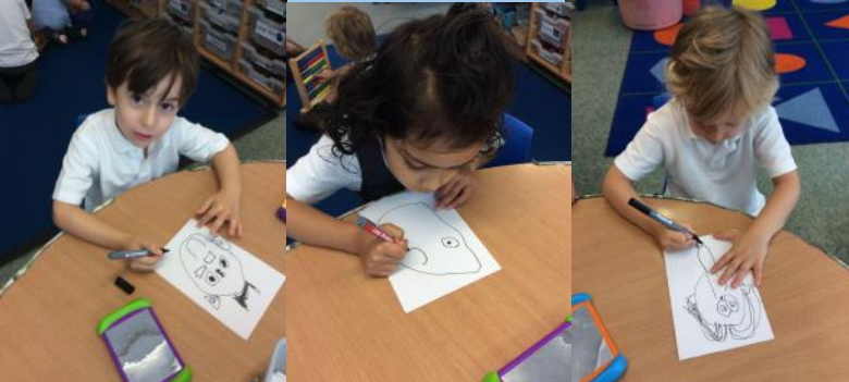
We each drew a self-portrait.