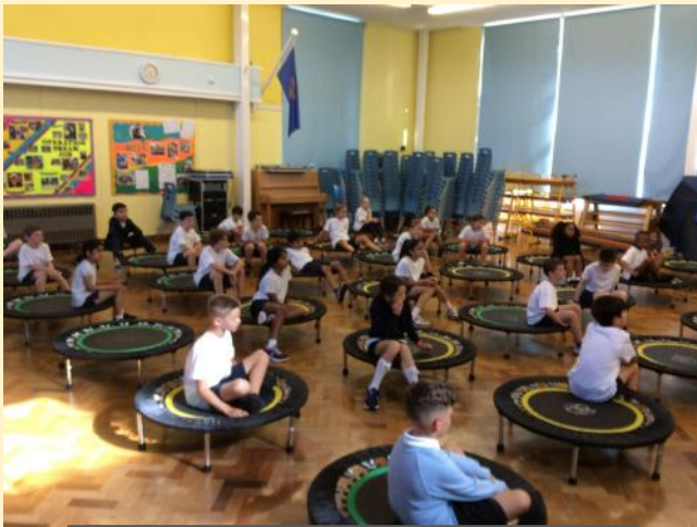
We started the school year by bouncing back into school