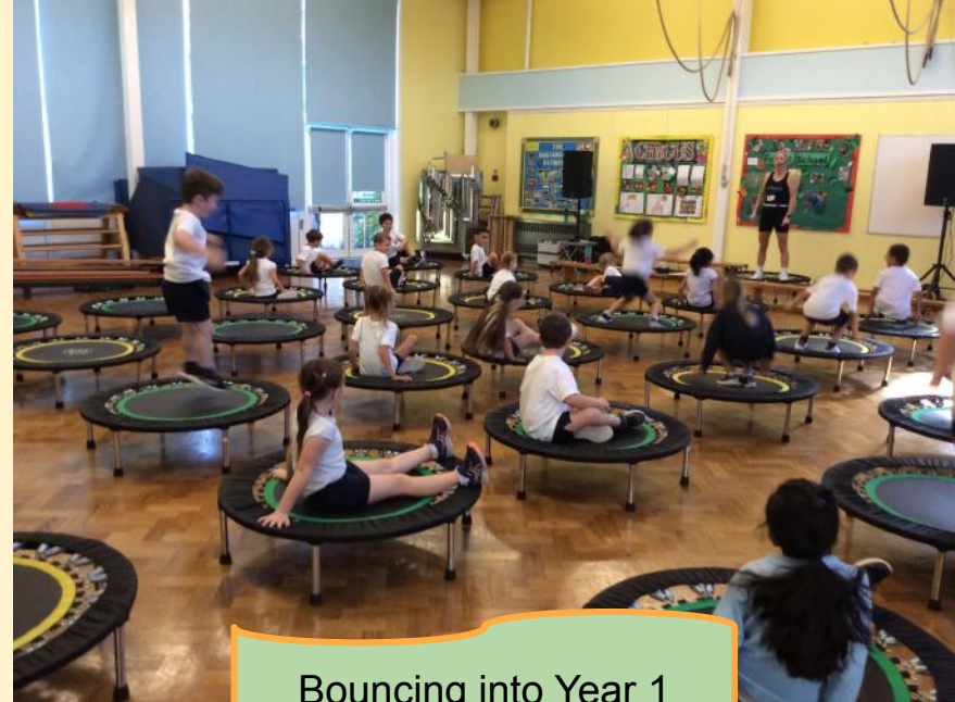
Bouncing into Year 1