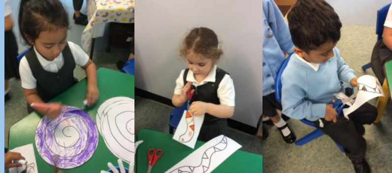
We practiced our cutting skills.