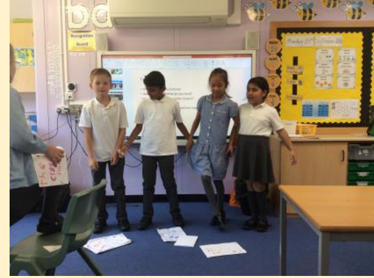
Team project day