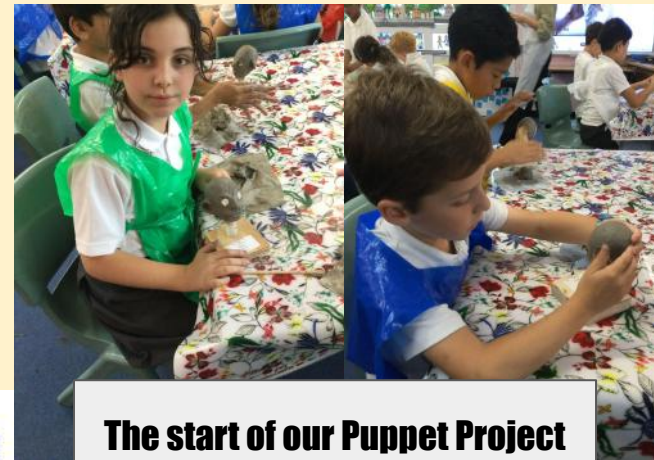
The start of our Puppet Project