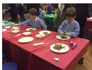
Christmas Bazaar 2018