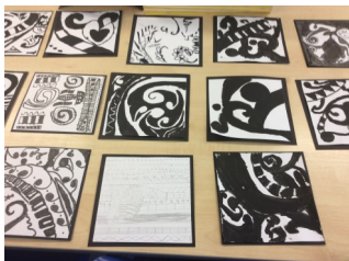
Y6 studied New Zealand

Keeping our personal and digital content safe should be a priority for everyone. Using passwords and encryption techniques can add extra layers of security. But some apps, which have been specifically designed for this purpose, can be misused or encourage more secretive behaviour, particularly in relation to videos and photos. That's why we've created this guide to help parents and carers understand exactly what these 'hidden photo apps' are and to raise an awareness of how and why they might be used by children and young people. Get your free guide on their website.