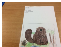
Y4 studied Canada