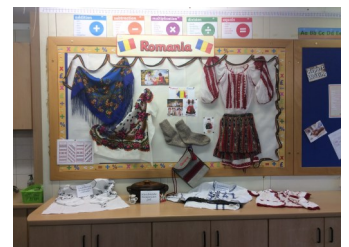
Y3 studied Romania