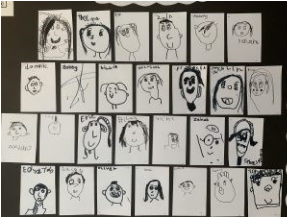
Reception's self-portraits are delightful!