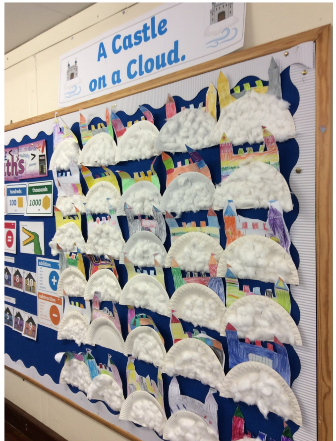
Y2 made a very creative Castle on a Cloud...!