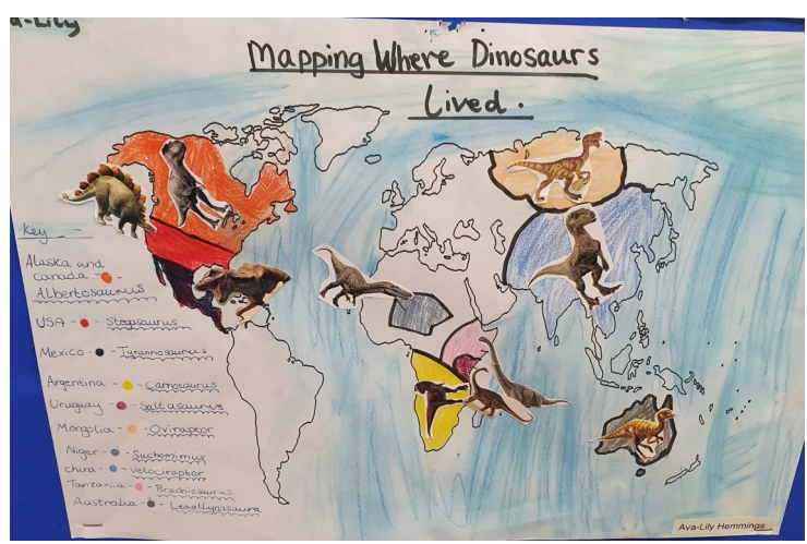
Ava-Lily mapped where dinosaurs lived and designed a key.

Y6 revised electrical circuits and learnt about both series and parallel and investigated how changing the voltage of a circuit affects the lightbulb.