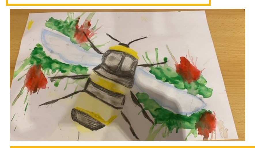
Brodie also sent in a beautiful bee drawing. Love the splattered background; very effective work boys!