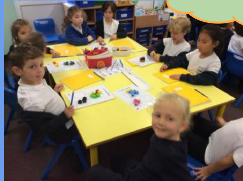
Finding a part in Maths