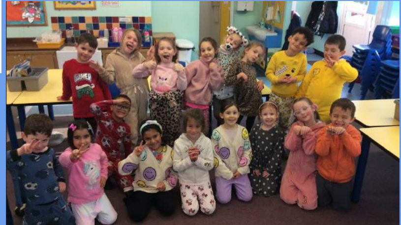
Children in Need