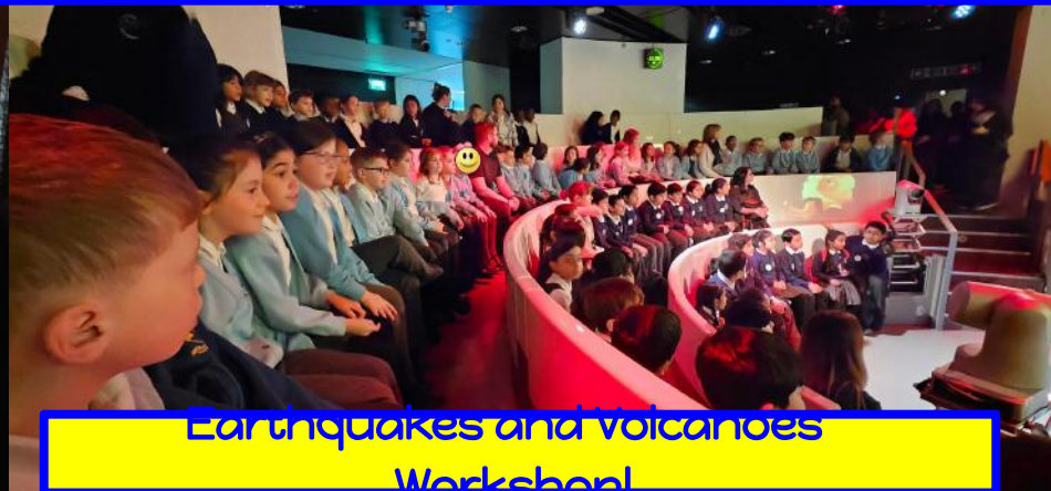
Earthquakes and volcanoes Workshop!