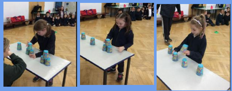
Speed stacking competition