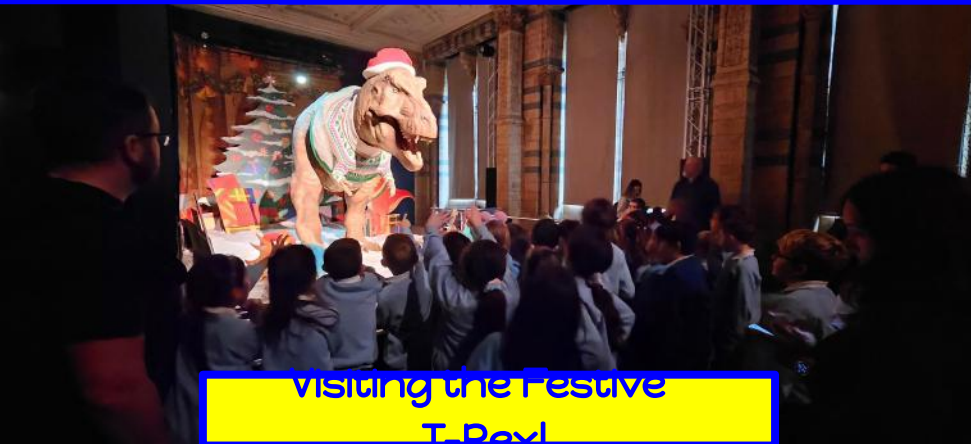
Visiting the Festive T-Rex!

Our grand day out to the Natural History Museum!