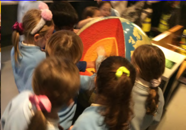
Layers of the Earth!