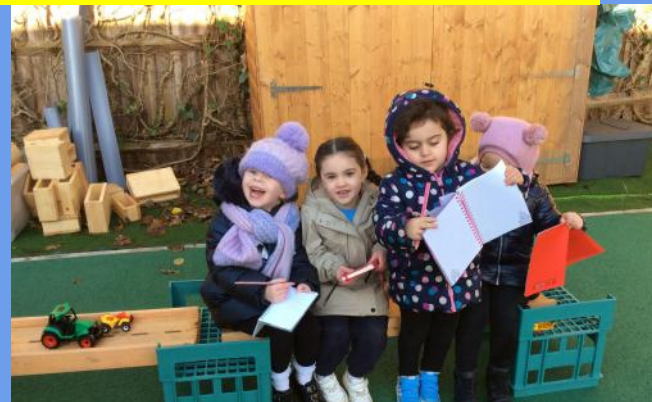
Busy taking orders for food to make in the mud kitchen - chicken nuggets and pizza were very popular!