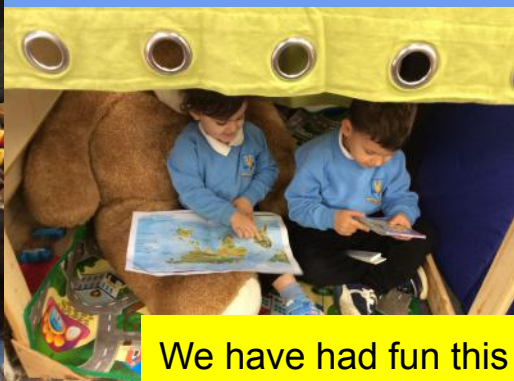
We have had fun this month - exploring the mud and the snow outside and using maps to find out more about different countries.