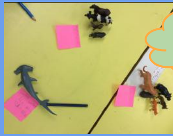
Sorting animals in Science