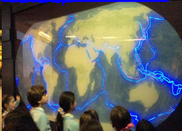
Finding Fault Planes!