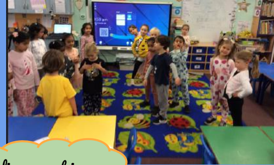
Children In Need