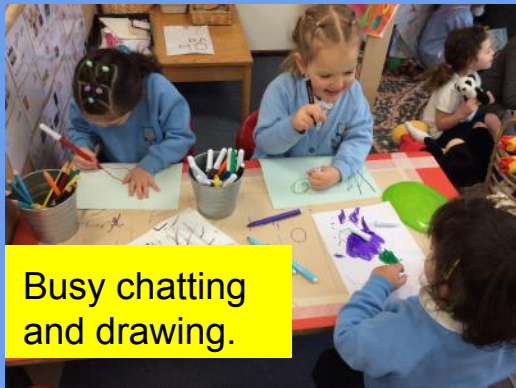
Busy chatting and drawing.