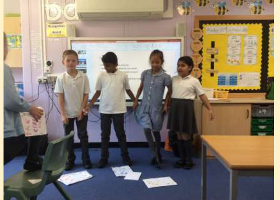
Team project day