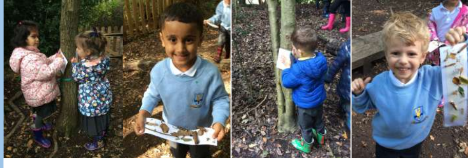
In the nature reserve, we created autumn memory sticks and made bark rubbings