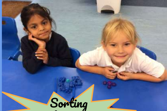
Sorting objects in maths