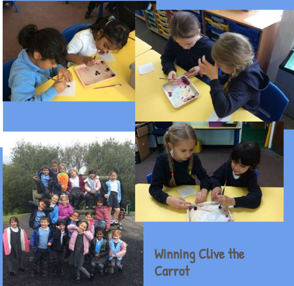
Winning Clive the Carrot