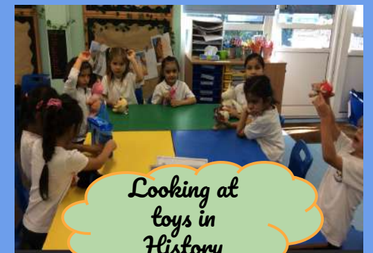
Looking at toys in History