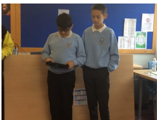
Controlling the drone!