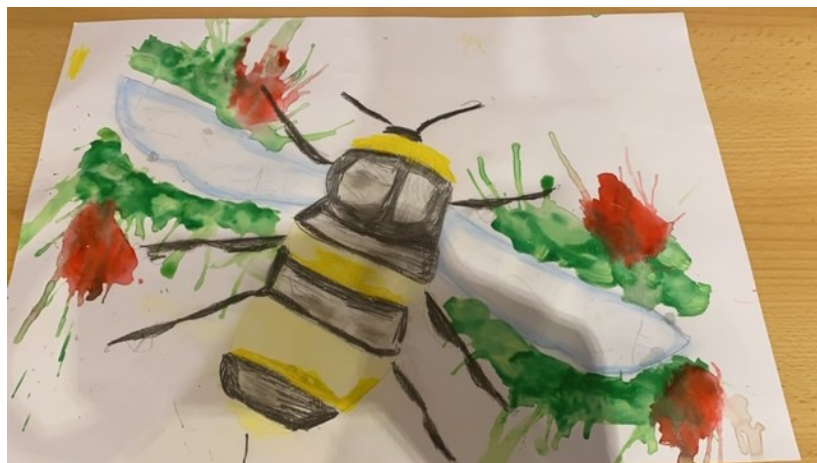
Brodie also sent in a beautiful bee drawing. Love the splattered background; very effective work boys!