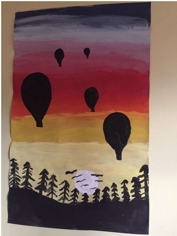
Emma's wonderful blended water colour sky with silhouetted balloons and trees. Very atmospheric Emma!