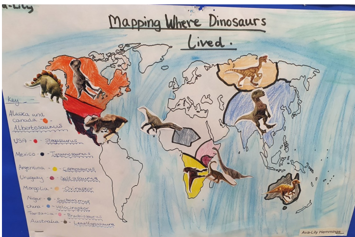
Ava-Lily mapped where dinosaurs lived and designed a key.