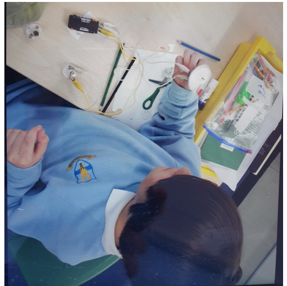
Y6 revised electrical circuits and learnt about both series and parallel and investigated how changing the voltage of a circuit affects the lightbulb.