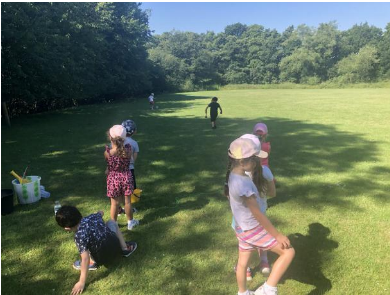
Reception races (Left) and Y6 cricket, football and tennis....