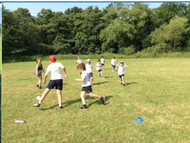
The groups in school have been participating in extra sporting activities this week. This is our key worker group on a balloon popping activity. No spectators to cheer them on but they had fun!