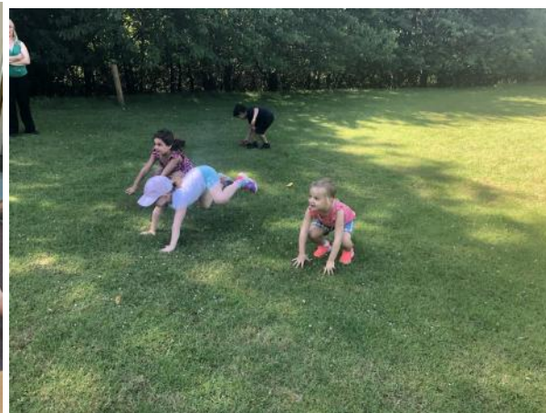
Reception enjoying an indoor and outdoor movement break!