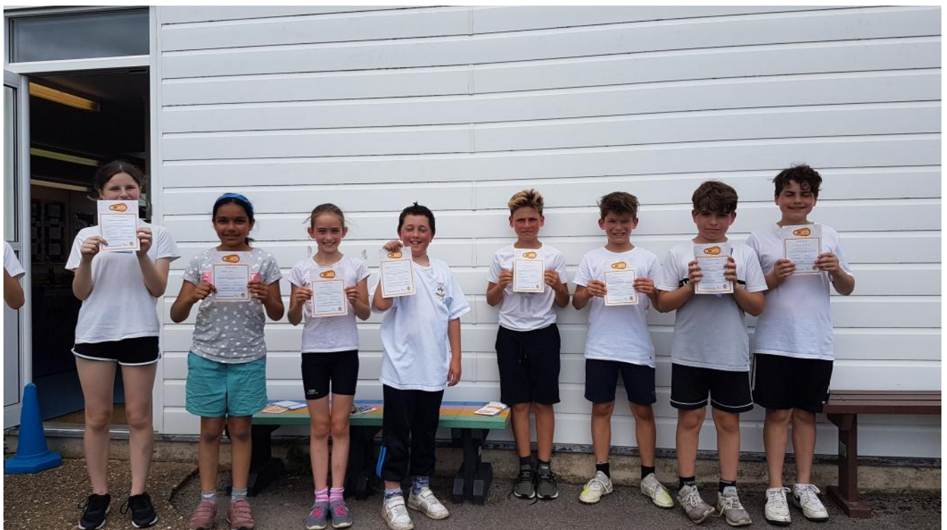
Our wonderful Year 6 with their Cycling proficiency certificates! CONGRATULATIONS Y6!!