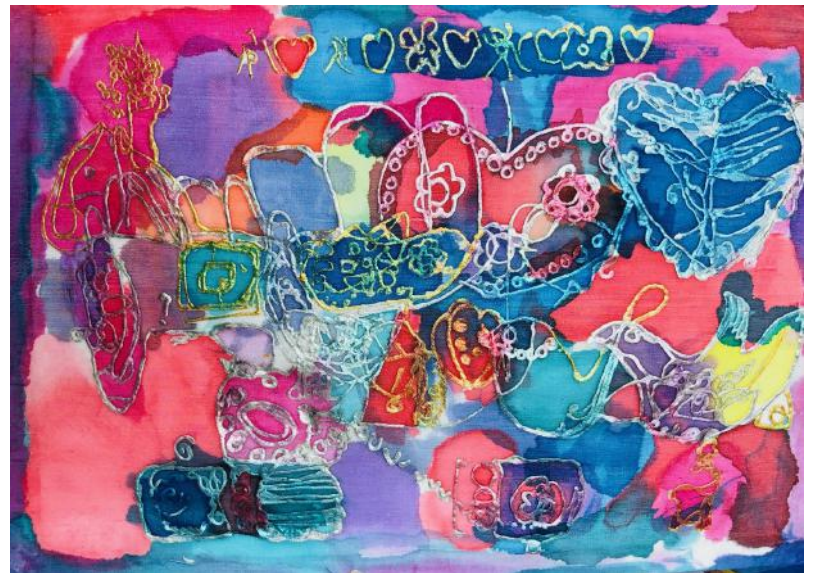
Silk paintings from Monday's Art Club. Beautiful work by them all! The Art Club work very hard on their projects and as you can see, it pays off!