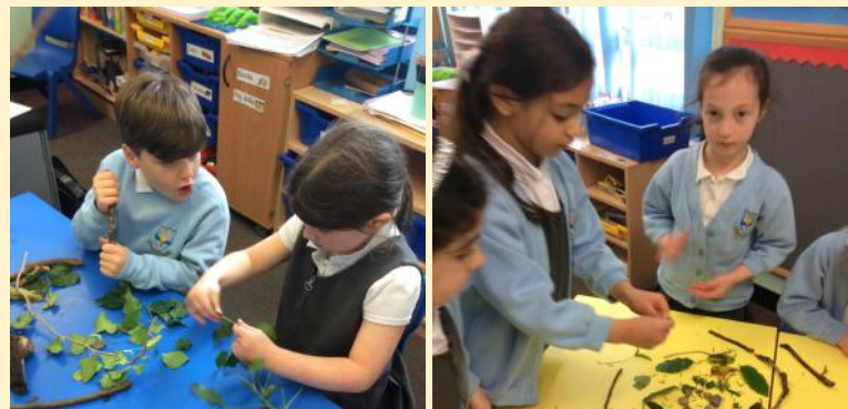
Creating art with nature.