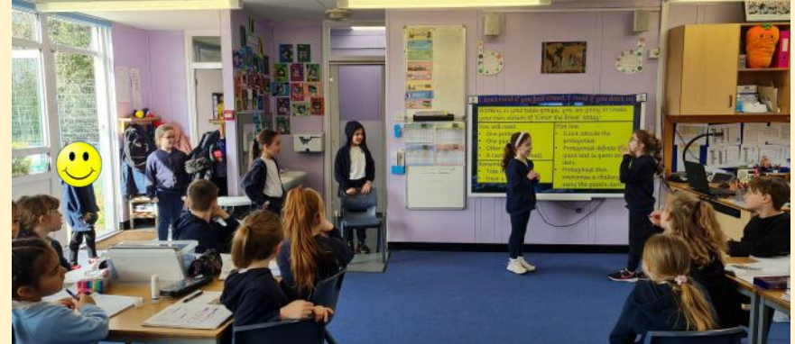
Planning Iron Age myths by role-playing our own version of 'Conor the Brave'!