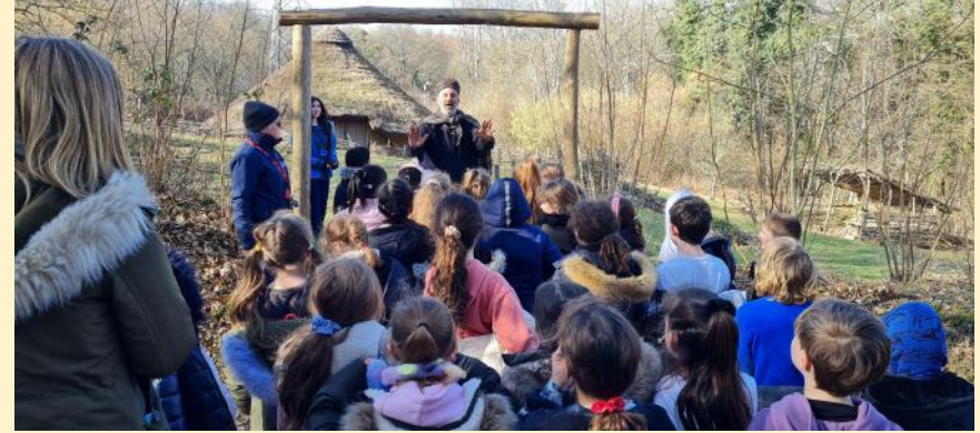
A Stone Age and Iron Age Experience at our day out to the Chiltern Open Air Museum!