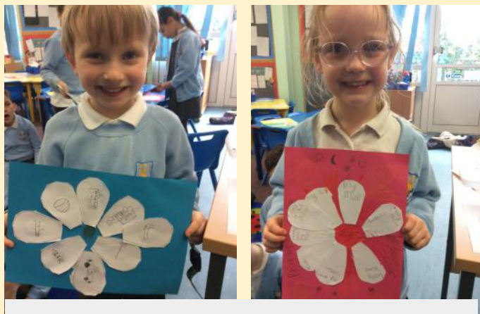
Exploring what is important to us.