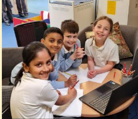
Our gymnastics and maths challenge teams going for glory!