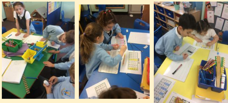
Brilliant maths learning.