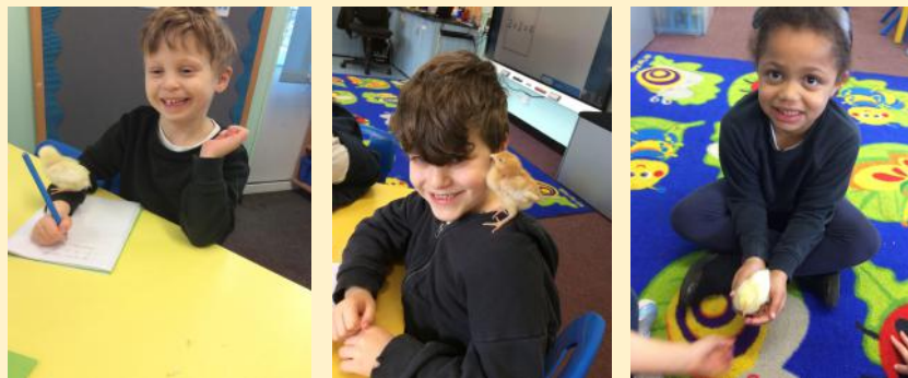
Our lovely chicks!