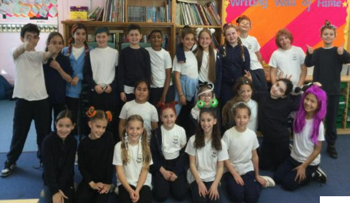
Crazy Hair Day