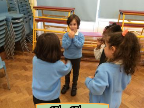
The Three Little Pigs