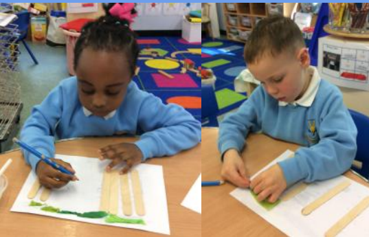
We learnt about the Jewish festival of Sukkot and then made Sukkah pictures pictures.