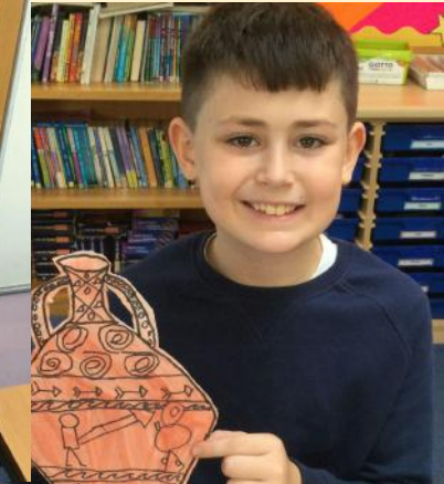
Drawing and Designing Greek Pottery In Art