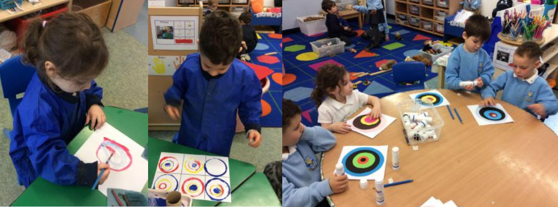
In our topic work, we learnt about the artist Kandinsky. We made lots of different circle and dot pictures of our own.