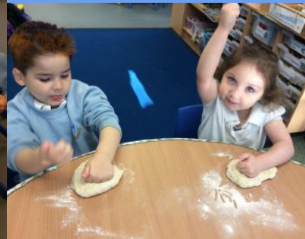
We loved learning to tell the story of The Little Red Hen. We did this with actions to help us remember the story. Then we made bread rolls and ate them for snack with butter and jam!