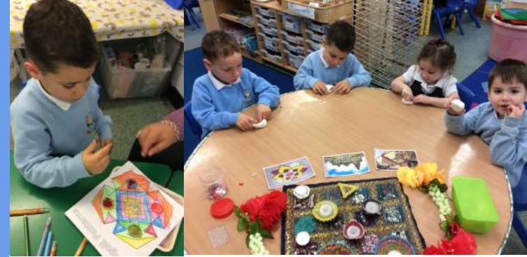
We made Diva lamps and Rangoli patterns after learning about the Hindu festival of Diwali.