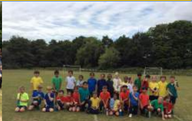
Staying active, keeping healthy and being put through our paces as part of a fantastic Sports Week!