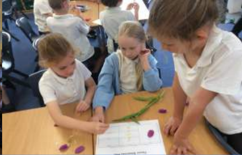
Dissecting flowers in Science!