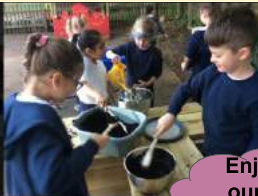
Enjoying our mud kitchen!