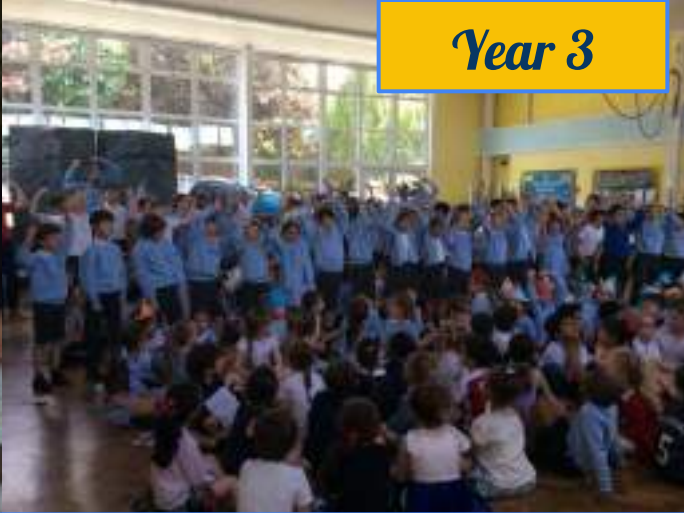
Singing YMCA for Take One Decade Week!