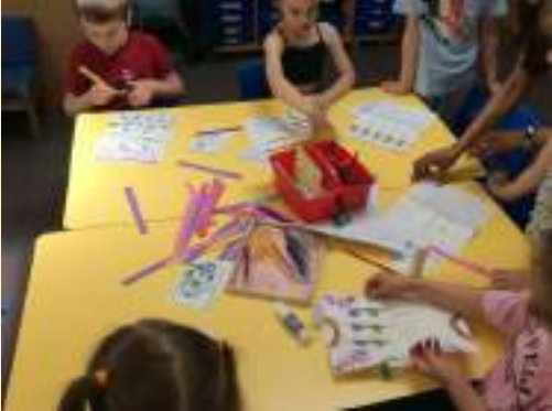
Paper Weaving and portraits!