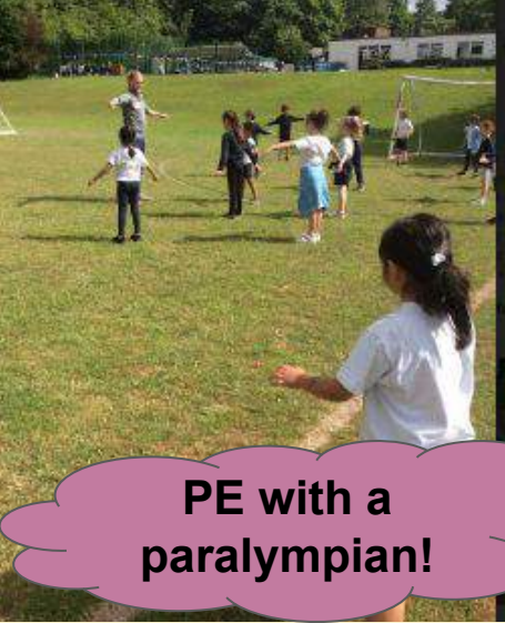
PE with a paralympian!