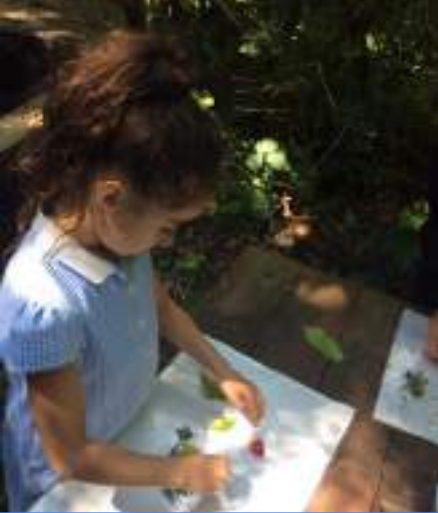
Hapa Zome in Forest School!