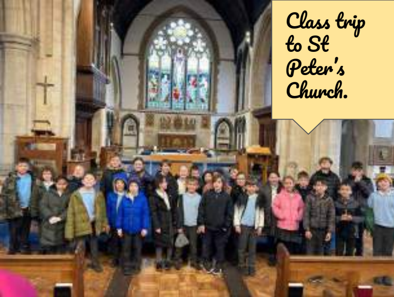
Class trip to St Peter's Church.