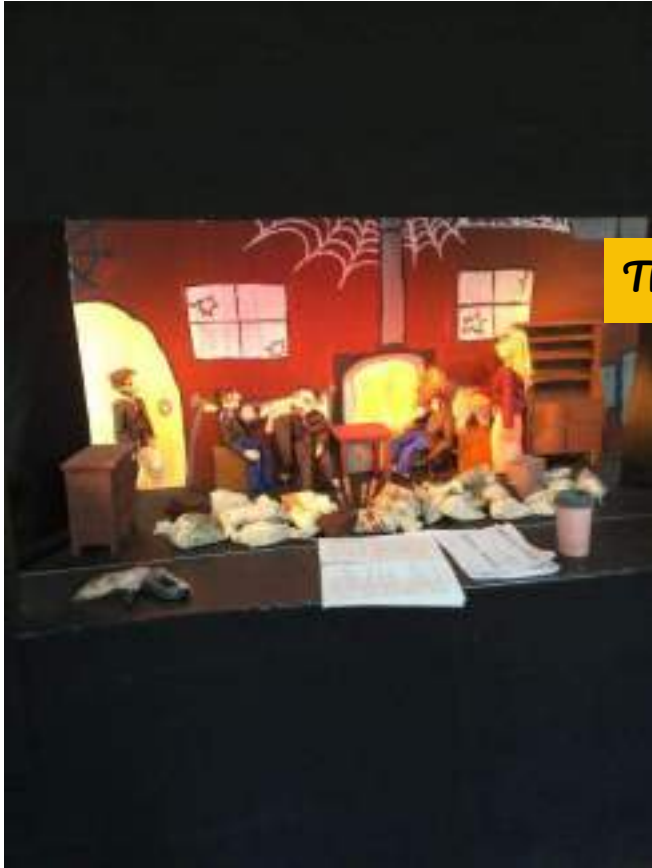
The Puppet Masters