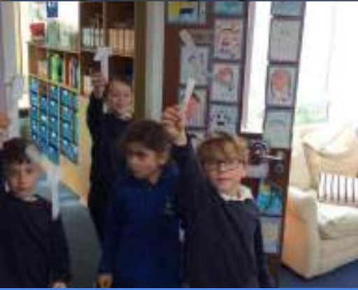
Paper helicopters for science week!