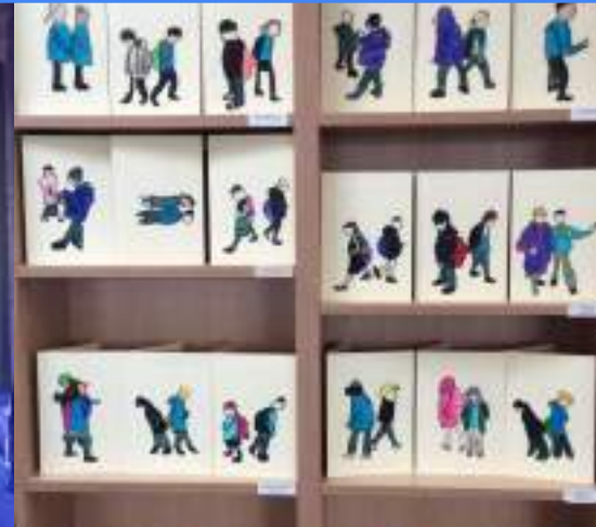
Artwork inspired by Julian Opie!