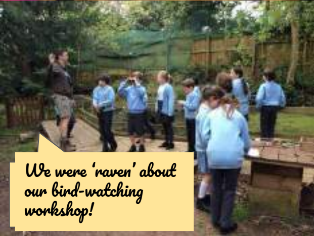
We were 'raven' about our bird-watching workshop!