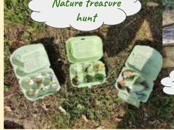
Nature treasure hunt