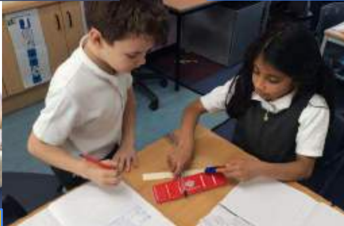
Investigating magnets in science!