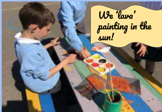
We 'lava' painting in the sun!