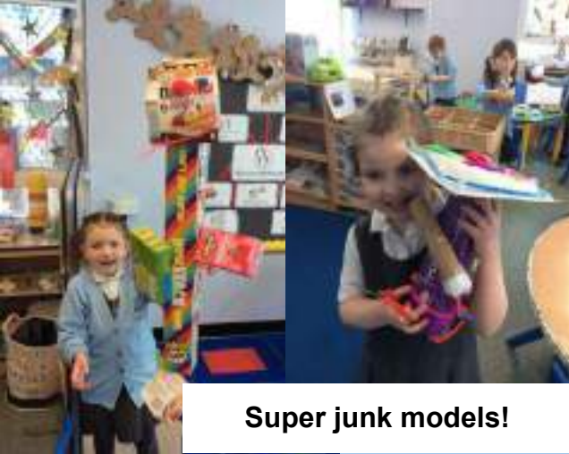
Super junk models!