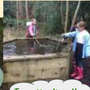
Investigating the pond