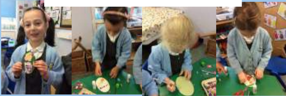
Decorating Easter eggs