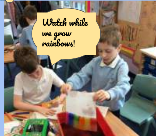
Watch while we grow rainbows!