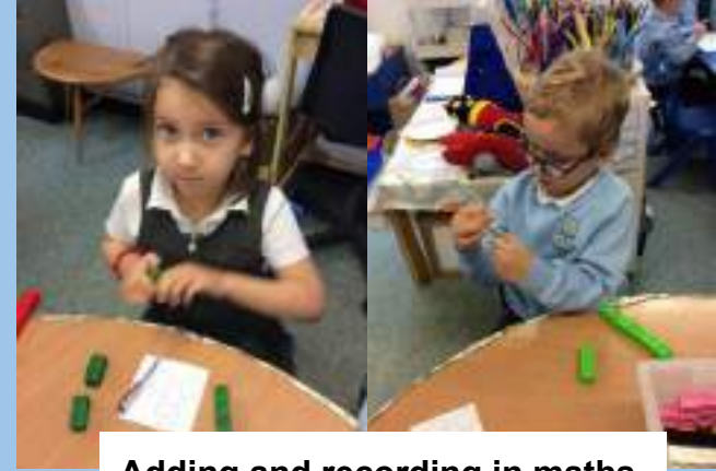
Adding and recording in maths