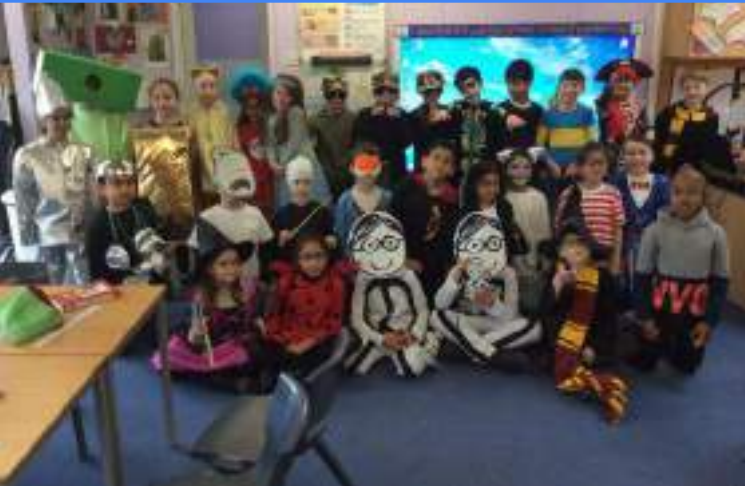
Colourful characters for World Book Day!