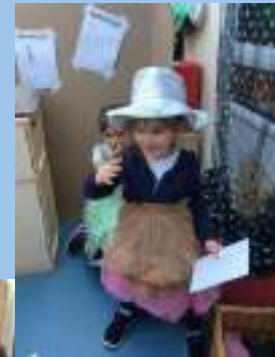
Gingerbread Man role play!